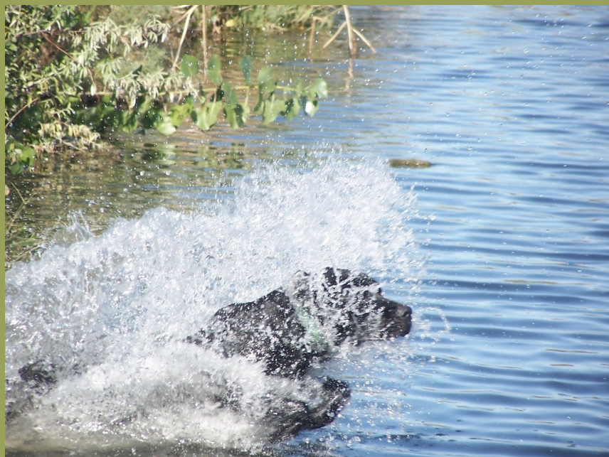
Dan Feighert's Shadow